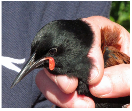
Close up of a tieke

Boyd Peacock, from the Foundation, attended the second release noting "that it was nice to get out and see conservation in action rather than just reading funding applications".