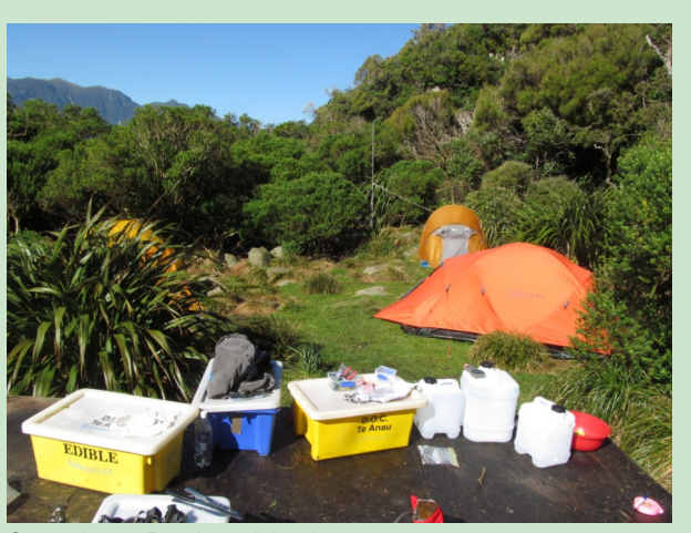
Campsite on Breaksea Island