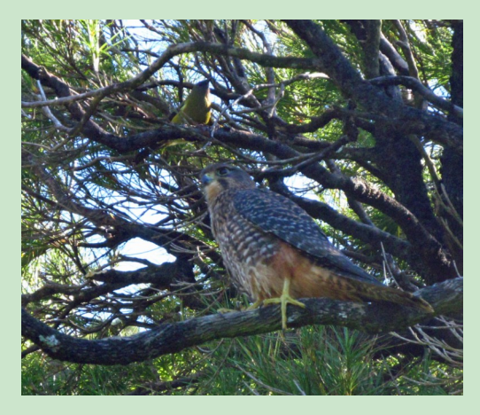
Falcon watching a mist net site on Breaksea Island

The dawn chorus greeted the team on Breaksea. David continues: "There were still saddleback out there calling so we were hopeful of catching more birds for transfer to Rona. But having already caught 12 tieke, it was much harder to attract birds to the nets. Having a falcon sitting above one net site didn't help!"