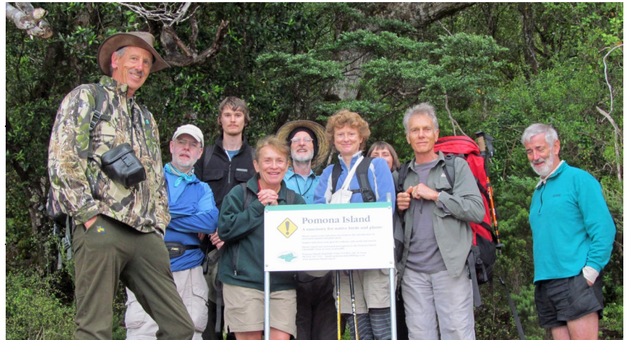
Volunteers ready to check traps on Pomona in January 2016 - no rats yay!

It is not just Rona that is providing a good news story. Our efforts to eradicate rats from Pomona using a combined bait station and trap network appears to be paying off. “We have now gone nearly six months without trapping a rat” said volunteer Project Manager Viv Shaw. From a high of 220 rats in Spring 2013 to no rats in the Summer of 2016 is a phenomenal result. And it is all thanks to our team of volunteers who help us check our traps on a regular basis. Again only time will tell whether we have succeeded in eradicating the rats from Pomona. So we’ll keep you posted.