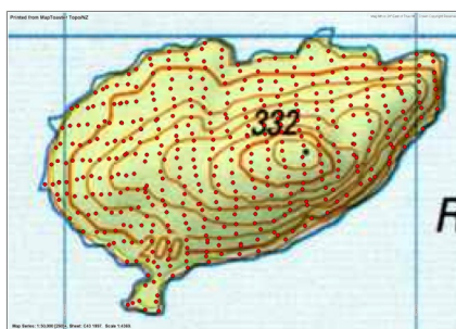
Map showing bait station network on Rona

Following extensive research and planning, the Trust set up a bait station network. Contractors (Contract Wild Animal Control Ltd) placed 464 bait stations on Rona on a 25m x 50m grid. Meanwhile, volunteers established six tracking tunnel lines, with seven tunnels on each to monitor the success of the operation.