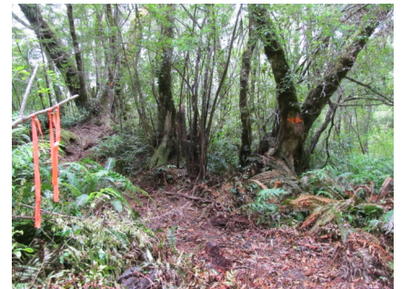
A freshly cut track on Pomona